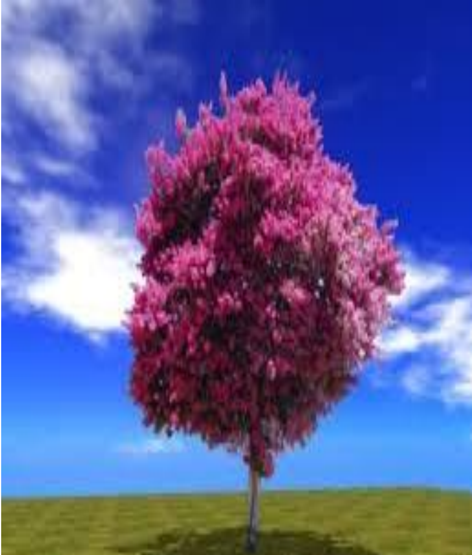
Esther, Hadasah: The Myrtle Tree